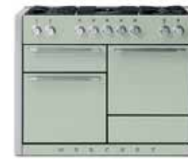
ESSEX SHADE COMING SUMMER 2023