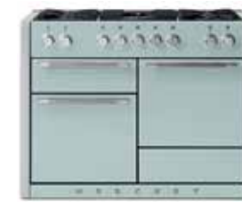
DOVER MIST COMING SUMMER 2023