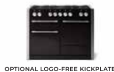
OPTIONAL LOGO-FREE KICKPLATE